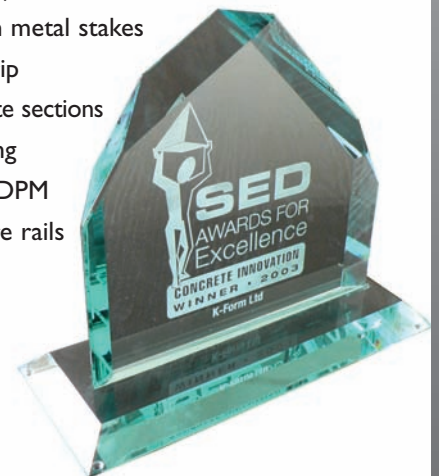
SED Award for Excellence in Concrete Innovation